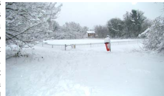
The Recreational Ground Langley Vale

With the heaviest snow fall in years hitting the Woodcote Ward this February, residents showed that you only need to scratch the surface to find the community spirit reminiscent of the 'Blitz' lying just underneath. Residents took to the streets, built snowmen, threw snowballs, kept an eye on their elderly neighbours and enjoyed talking to people they had never met before. The much maligned 4 x 4 proved to be an invaluable aid in helping maintain supplies and essential journeys for people who would otherwise have been stranded. Having 'broken the ice' in this way, there is no reason why we should not continue with these new found friendships.